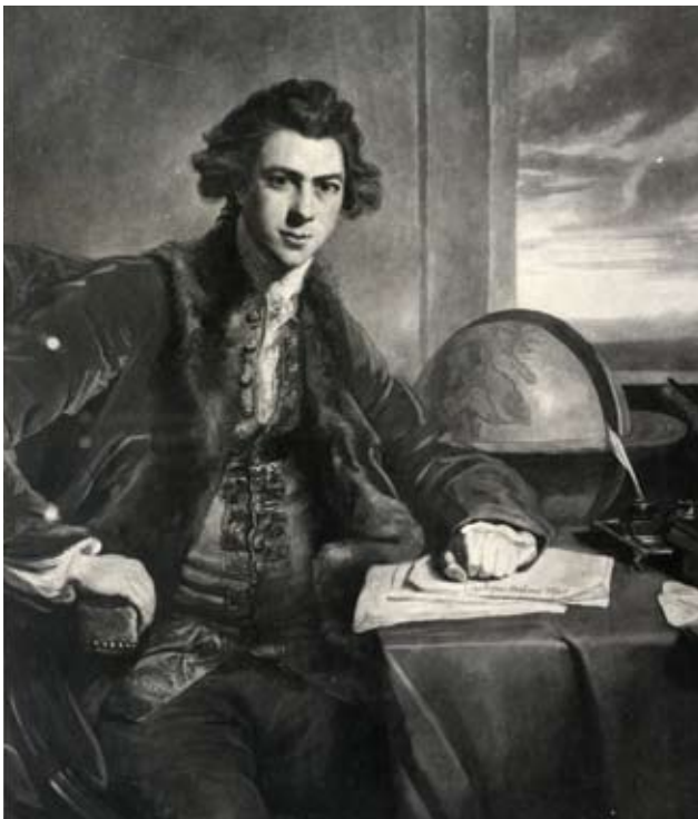
▲ Sir Joseph Banks (1743–1820)

Joseph Banks was born in 1743 to a wealthy family. He died in 1820. He was an explorer and naturalist, with a passion for botany 15 . He strongly supported science and was President of the Royal Society for a record 42 years.