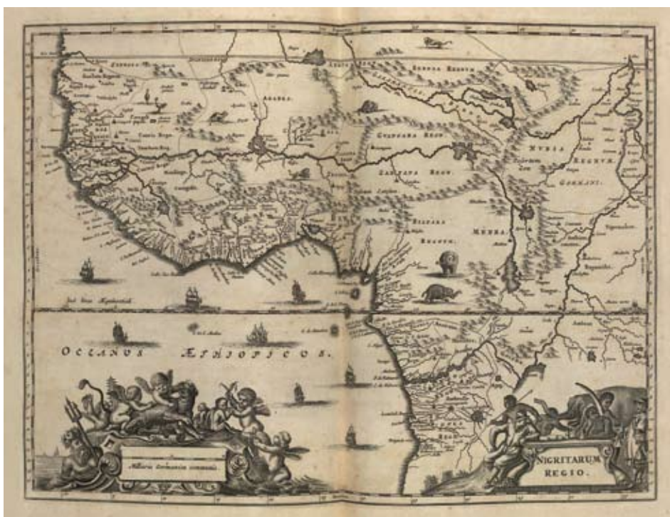
▲ Map of 'Negro-Land', Ogilby, 1670

Tomba was captured by African traders with the help of the Europeans they supplied. He was sent to a fort on Bance Island, Sierra Leone. He was now owned by the pirate John Leadstone, commonly called Old Cracker.