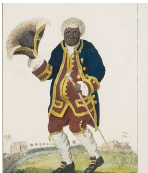
▲ The celebrated Gramman Quacy’, engraving by William Blake, Stedman, 1806