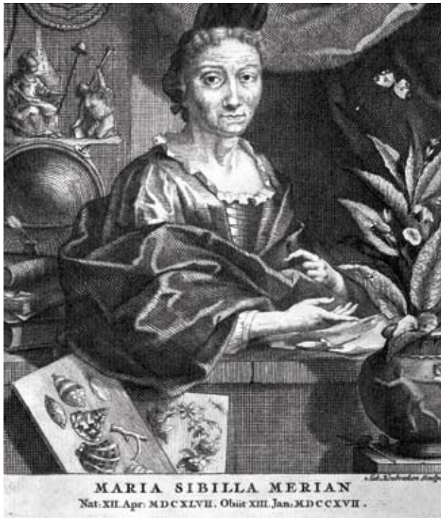
▲ Anna Maria Sibylla Merian (1647–1717)

Maria Merian was born in Germany in 1647 to a family of artists. She lived most of her life in the Netherlands, and died there in 1717. She was a naturalist as well as an artist, and as a child insects fascinated her. Her diaries show she observed how silkworms change (metamorphose) into moths when she was just 13, nine years before this was published in Europe. Previously, it was widely thought that insects were generated from decaying leaf matter.