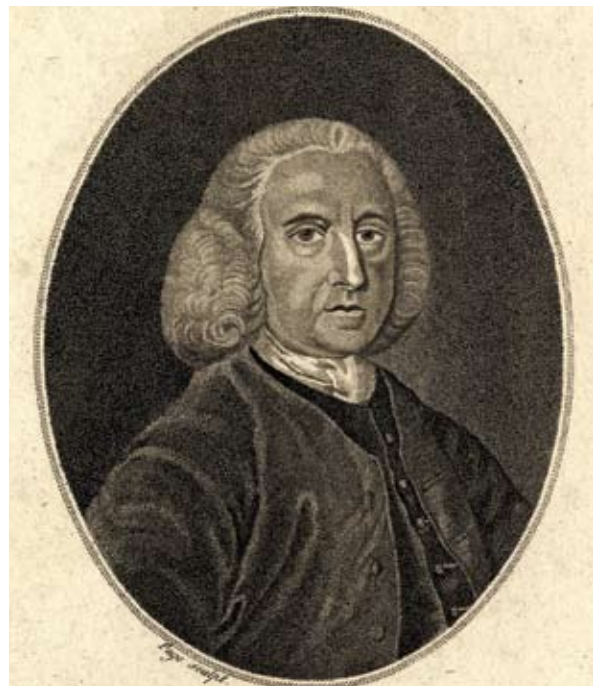
▲ Peter Collinson (1694–1768), Picture Library reference 52076