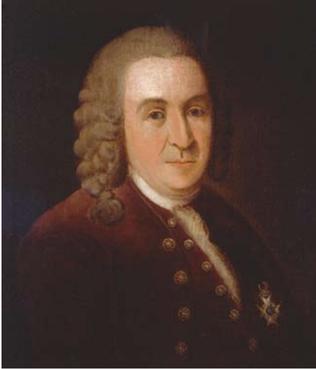
▲ Carl Linnaeus (1707–1778), Picture Library reference 4251

Europeans saw Africa and the Americas as places rich in plants to exploit for profit 4 . Natural historians 5 saw them as places to advance their knowledge of science. In the 1600s collecting natural history specimens was popular and profitable across Europe, especially in Holland and France as well as Britain. These countries had overseas colonies and many specimens were sent back to Europe. Specimens from Africa and the Americas played an important part in the development of botany (plants) and entomology (insects).