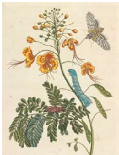
▲ Flos pavonis ( Caesalpinia pulcherrima ), Merian, 1705