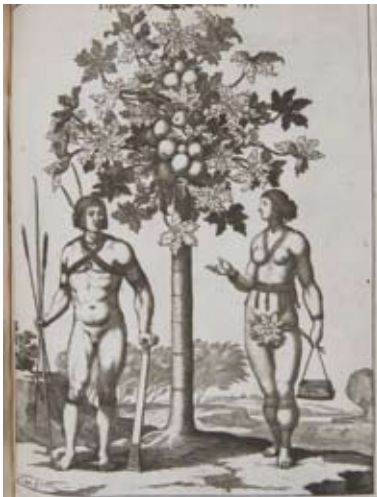
▲ One of the earliest recorded examples of life in the Caribbean (French colonies) Du Tertre, 1671

Some illustrations show representations of indigenous peoples at the time of the transatlantic slave trade, although they are often romanticised.