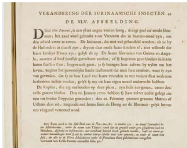
▲ An extract from Metamorphosis Insectorum Surinamensium... , 1705, describing 'Flos pavonis'

'This plant Flos pavonis has parts which are used by the slave women to induce abortion. The Indian slave women are very badly treated by their white enslavers and do not wish to bear children who must live under equally horrible conditions. The black slave women, imported mainly from Guinea and Angola, also try to avoid pregnancy with their white enslavers and actually seldom beget children. They often use the root of this plant to commit suicide in the hope of returning to their native land through reincarnation, so that they may live in freedom with their relatives and loved ones in Africa while their bodies die here in slavery, as they have told me themselves.' (Merian, quoted in Counter, 2006)