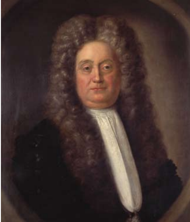
▲ Sir Hans Sloane (1660–1753)

Hans Sloane was born in Ireland in 1660 9 . He died in 1753. He lived in London for most of his life and became a wealthy and popular doctor. His passion was natural history and he collected a huge number of plants and animals, as well as coins. He was President of the Royal Society from 1727 to 1741.