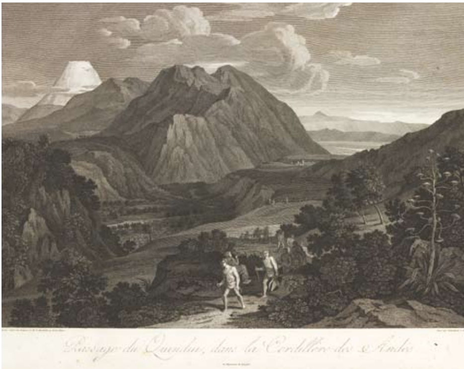
▲ A European being carried 'by man's back', Humboldt, 1816

'... brutes are botanists by instinct'. (Long, quoted in Schiebinger, 2004, p82) 49 .