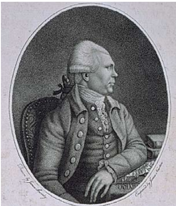
▲ Daniel Solander, 1784

James Petiver was an English apothecary and had many plants and insects collected for him from around the world, but especially from the Caribbean and Americas. His plant specimens alone filled more than 100 bound volumes. As well as building up his 'Museum Petiverianum', he sold duplicates of rare specimens in his collection and 'complete sets' of certain species. Hans Sloane was a friend of James Petiver and bought his collections after his death in 1718. James Petiver's collection is therefore now in the Natural History Museum and his private papers are in the British Library.